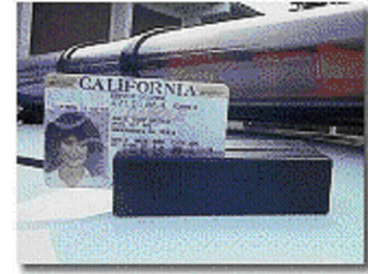
The laptop component enables the entry of:

All relevant data, help information, screen formats, and validation tables are stored in the laptop and carried "on board," eliminating the need for a continuous communication link with the A.C.I.S. system for operation.